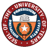
TABLE OF CONTENTS THE UNIVERSITY OF TEXAS SYSTEM BOARD OF REGENTS CONSENT AGENDA

Committee and Board Meetings: May 8-9, 2024 Austin, Texas